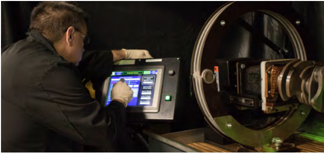
12" Touchscreen operator interface