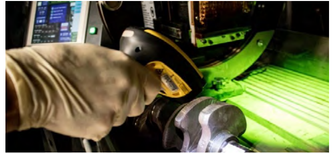
Scanner capable of reading barcodes and QR codes